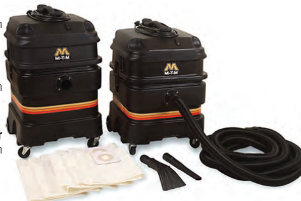
MV-1300-0MEV & MV-1800-0MEV are shown with VX-0001 option

Note: These options will remove the 2-piece aluminum extension wand (16-0391), combination floor tool (33-0360), commercial squeegee floor tool (33-0359) and the upholstery tool (33-0327) that come standard with the vacuum.