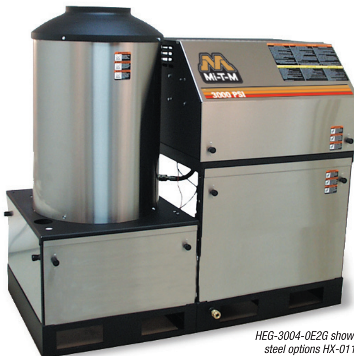
HEG-3004-0E2G shown with stainless steel options HX-0115 & HX-0116

10-inch draft diverter included (21-inch height)