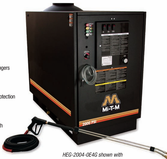
HEG-2004-0E4G shown with HX-0117 painted box kit option